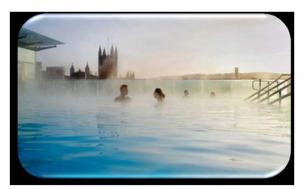
Figure 2 . Thermae Bath Spa

Culture, place and marketing intertwine in a grammar of promotional discursive strategy in the case of Jane Austen's Home, which is no longer a passive heritage-place, but the very example of interactive marketing as it is transformed into a commodity ready to be recreated as an accommodation. The marketing strategy relies on a matter of territorializing through cultural competence, as the offer consists in a prize for the participant who finds the most suitable name for the penthouse: