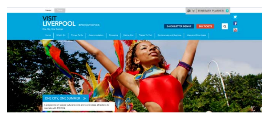
Figure 6. Home page of Liverpool visiting website

The enumeration of these binary oppositions (immense/intimate, mainstream/marginal, classical/contemporary) makes the public feel included into an overwhelming presentation of a wide range of activities. Furthermore, the personality of Liverpool visiting website also distinguishes by the sky-blue colour of the head-line, suggesting calm and freedom; it may also forecast clear sky for the running summer season which is filled with inspiring activities for both locals and visitors, as this bright colour reinforces the emotion of hosts-guests connection, of home-destination connection, eventually of real-virtual connection. Actually, we underline the function of colour within the rebranding of cities as it has the capacity "to define perceived nature of space and the cultural and emotional characteristics of place " (Donald & Gammack, 2007: 115).