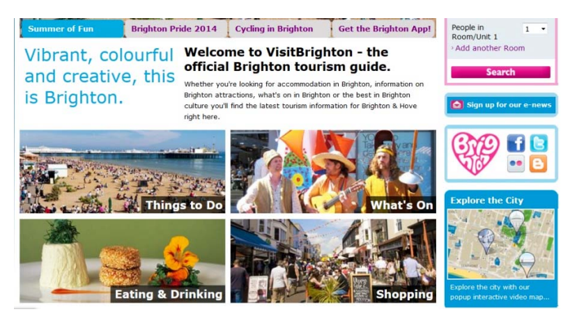
Figure 7. Home page "Summer of Fun" Brighton visiting website

An official site of Scotland's National Tourism Organization presents Edinburgh and the Lothians as a regional entity, stressing upon the ethnic side of Edinburgh city as a touristic destination. The website frontpage text is filled with adjectives like "stunning", "striking", "exhilarating", which belong to the same semantic field as the word "vibrant"<sup>12</sup>, that we find on another websites as well. This linguistic strategy is employed in order to subconsciously imbue an energetic mood to the reader: